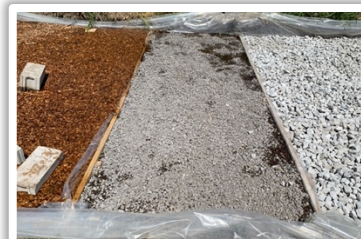
Three 'cells': woodchips, slag, and gravel.