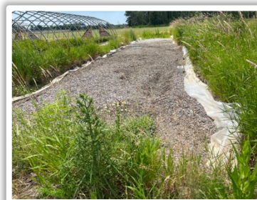
A hybrid treatment swale at a container nursery.